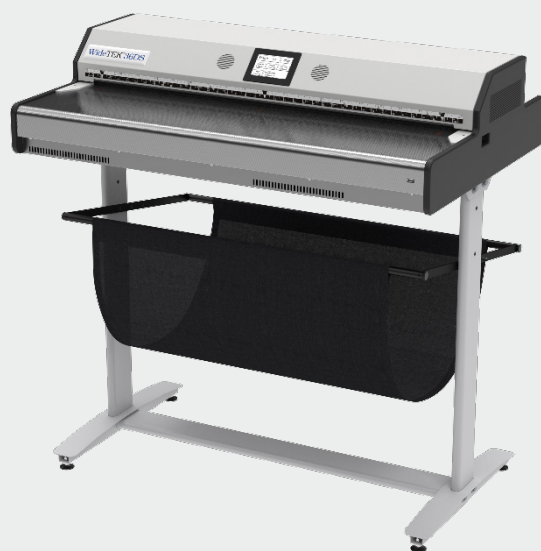
Side view of the WideTEK® 36DS with document collection basket. Scan stacks of newspaper pages without having to collect them each time they go through.

The scanner features two camera boxes, both consisting of three CCD systems, integrated into the upper and lower part of the device. WideTEK® 36DS captures both sides of the newspaper at the same time. After scanning, software separates the scanned document into four single images, capturing the left and right half of the front and back of the newspaper - everything in one single step.