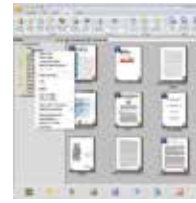
The PaperPort SE14 main screen

The Professional Choice to Organize and Share Your Documents