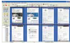
The AVScan X main screen

The Intelligent Document Management Tool