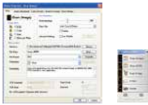
The Button Manager V2 main screen

Button Manager V2 makes it easy for you to scan and send your image to your favorite destinations with a press one button. Now the new version comes with an innovative feature to let you scan and automatically upload the scanned document to popular cloud repositories such as Google Docs, Microsoft SharePoint or FTP. In addition, the iScan feature allows you to insert the scanned image or recognized text after optional OCR (Optical Character Recognition) process to your text editor such as Microsoft Word to get your job done easily and quickly.