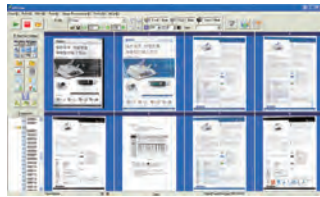
The AvScan 5.0 main screen

-The Intelligent Document Management Tool